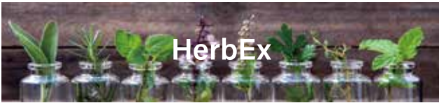
천연 식물에서 화장품 원료로 사용하기 좋도록 유효 성분을 정제하는 기술