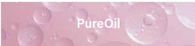
천연 유래 단일 식물성 오일 제조 기술