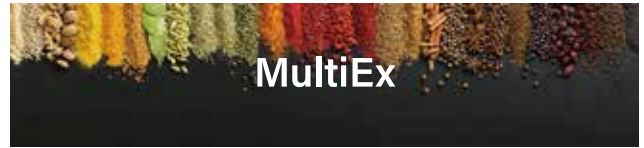
천연 식물 추출물을 혼합하여 부작용을 줄이면서 시너지 효과를 낼 수 있는 기술