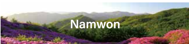
풍부한 식물자원을 가진 남원 지리산권의 천연물 유래 원물을 사용한 원료