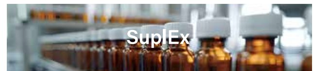
글로벌 공급망을 통해 대량으로 수입한 고품질 제품을 소분하여 합리적인 가격으로 제공하는 원료