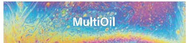
단일 오일을 혼합하여 시너지 효과를 내는 제조 기술