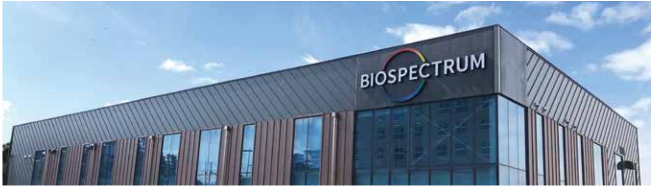
제주 NPP 센터 전경

바이োস펙트럼은 피부의약 관련 전문 기업으로서 인류의 피부건강과 삶의 질 향상이라는 가치 실현을 목표로 2000년에 설립되었습니다. 자연에서 얻어낸 천연소재들로부터 피부건강과 미용에 뛰어난 신소재 발굴을 위해 끊임없이 노력하는 피부과학 연구기업입니다.