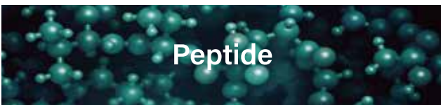
Peptide를 이용하여 특정 효과를 나타낼 수 있는 기술